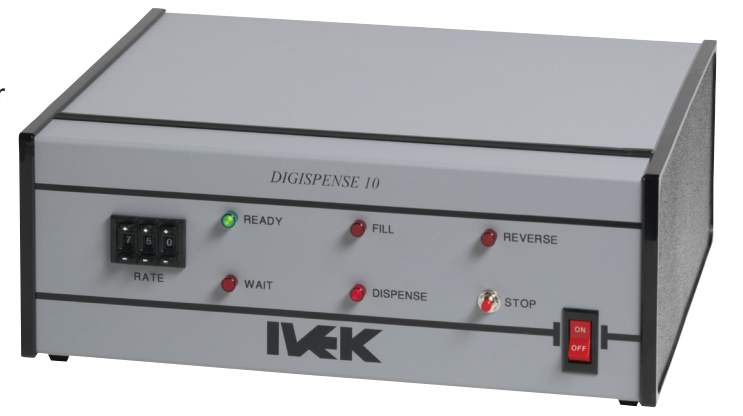
digispense 10/RS232 controller 37.5cm x 29.8 cm x 13.3cm