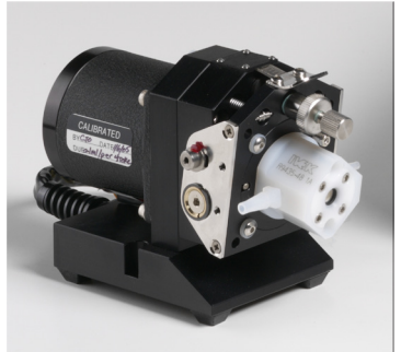
single-end motor base module 7cm x 12.8cm x 10cm

An RS232 interface port on the controller module makes the system easy to link to computerized technology. Several software companies have developed complete turnkey systems with networking capabilities to maintain patient records, prescription information, data acquisition and process validation. Many of these companies integrate the IVEK Digispense 10/RS232 Methadone Dispenser for the fluid dosing.