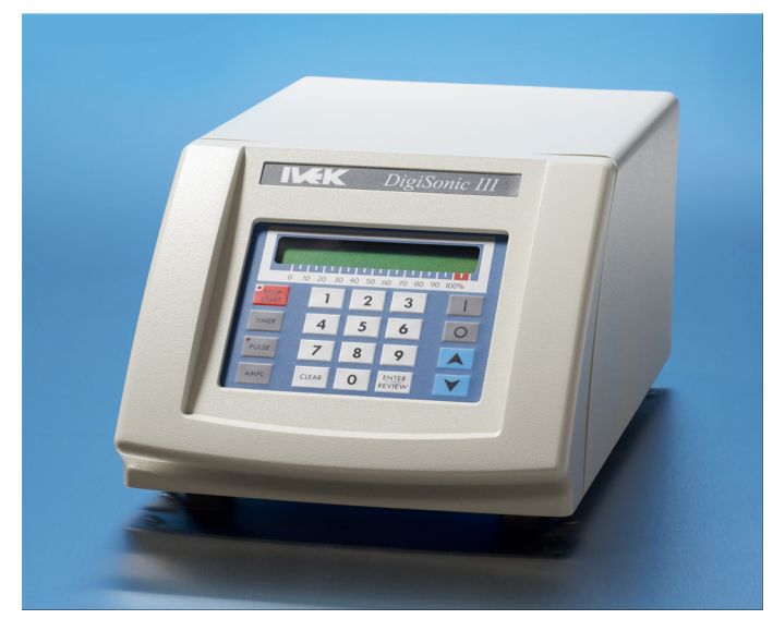
digisonic IIi controller module 146mm H x 203mm W x 349mm D