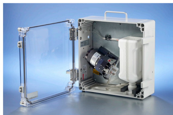
FREE Installation & Calibration of your Existing Pump with CSDS Purchase

*Optional With IVEK's Digispense 10/RS232 & Digispense 1000