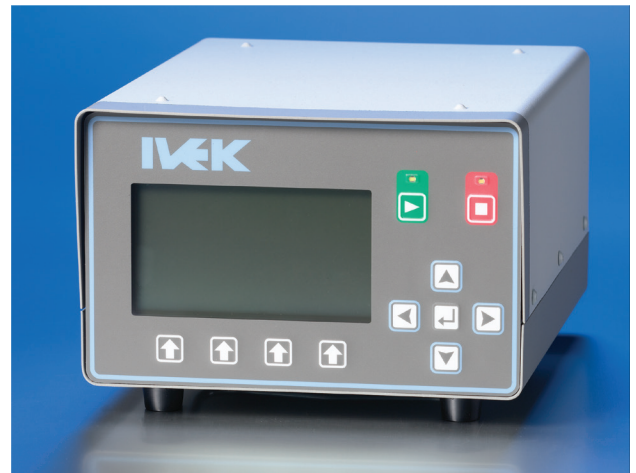
digispense 3009 controller module 21cm x 29.2cm x 14.6cm