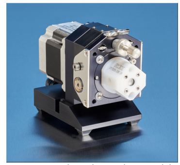
ngle-end motor base module 7cm x 12.8cm x 10cm