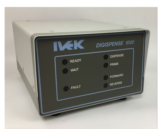
DigiSpense® 1000 Controller* 28.3cm x 14.3cm x 45.2cm

IVEK CORPORATION 10 FAIRBANKS ROAD NORTH SPRINGFIELD VERMONT USA 05150 TEL (01) 802-886-2238 FAX (01) 802-886-8274 TOLL FREE IN NORTH AMERICA 800-356-4746